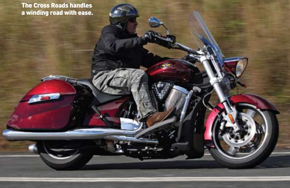
The Cross Roads handles a winding road with ease.

It was rock steady diving into bumpy sweepers and shook off deep potholes with ease. The front suspension is very well sorted despite its lack of adjustability and the rear shock offers plenty of travel, backed up by air adjustment. As we climbed onto the plateau the road became tighter with roadworks every few kilometres but even so, it was hard to fault the handling. Big bumps taken at high speed didn't knock it off line. The brakes scrubbed off speed quickly and I never felt either wheel