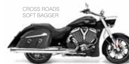
CROSS ROADS SOFT BAGGER