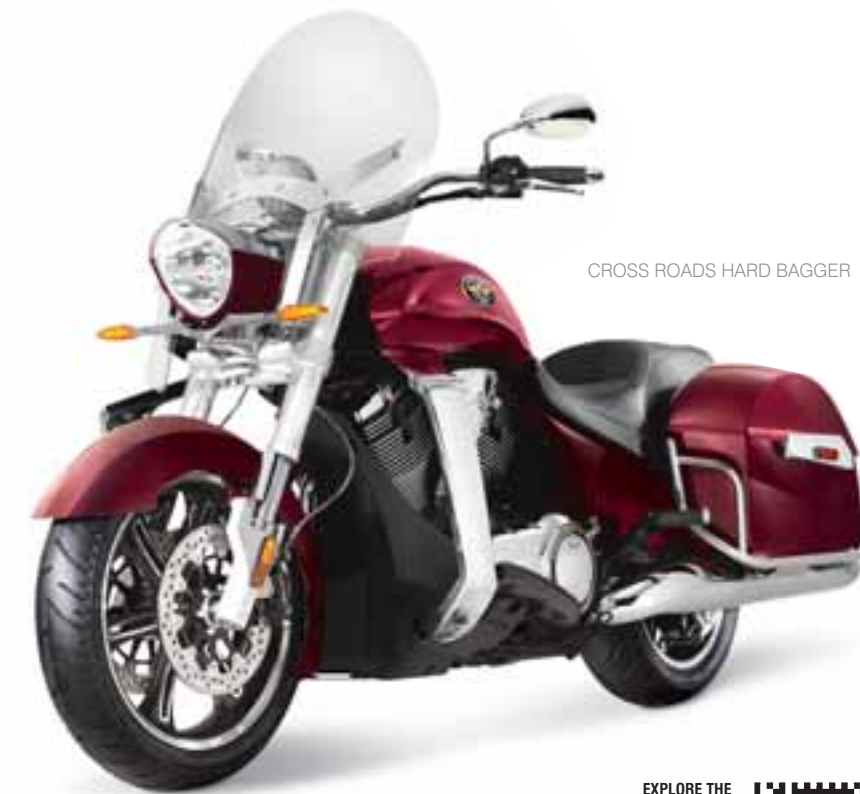
CROSS ROADS HARD BAGGER

Overseas models shown with optional accessories.